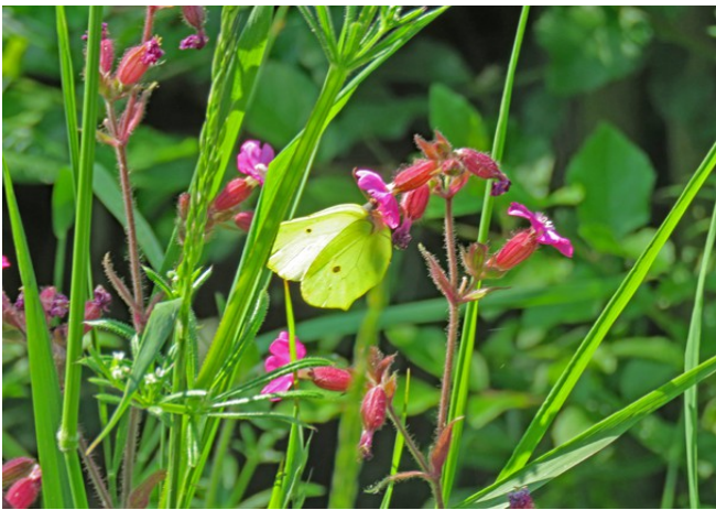
Brimstone on Red Campion