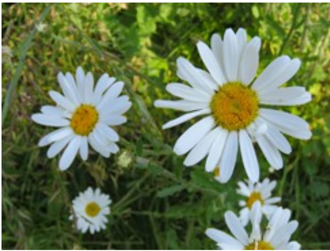
Ox Eye Daisies