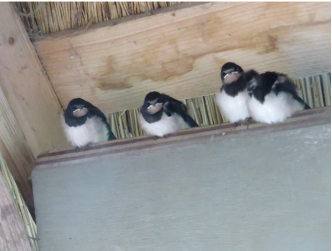
Juvenile Swallows at Hickling Broad