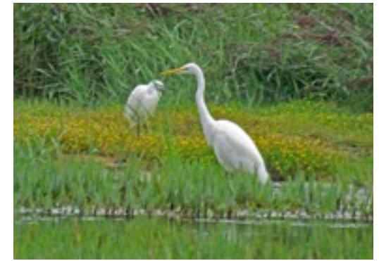
Great White Egret and Little Egret at Hickling Broad